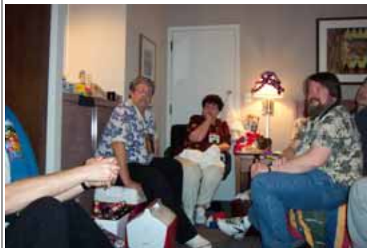
2003 Collectors' Nationals - Cincinnati, Ohio