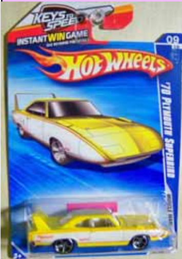
70 Plymouth SuperBird,