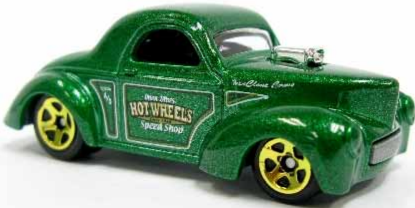
K-Mart day finds this September