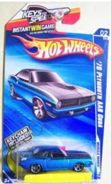
70 Plymouth AAR Cuda