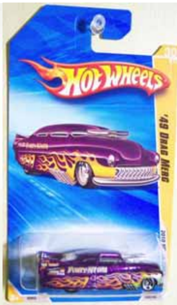
'49 Drag Merc,