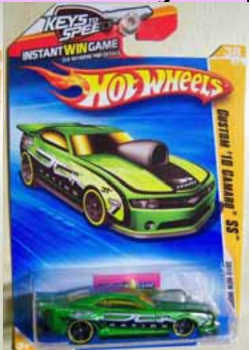
Custom '10 Camaro SS