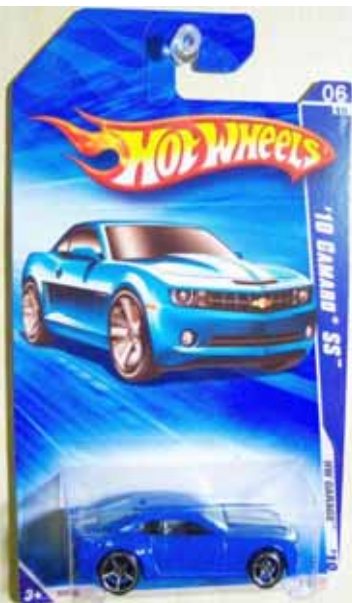
'10 Camaro SS,