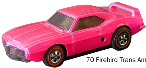
70 Firebird Trans Am

1971 was a big year for Sizzlers. New body designs dictated the advent of a longer battery. This battery was mounted lengthwise in the car. These are now