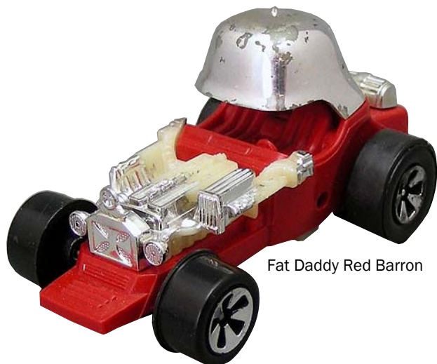
Fat Daddy Red Barron

1973 ushered in what would be known as Fat Daddy Sizzlers. Fat Daddys are now one of the most highly desired and sought after Sizzlers. They are oversized