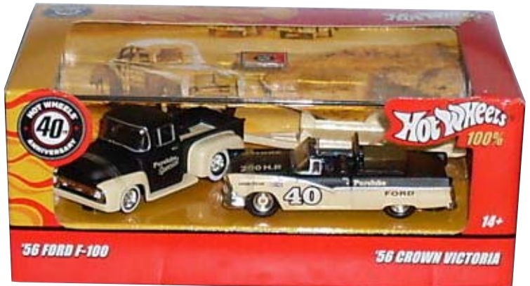
Retro Racing 2 Car Set