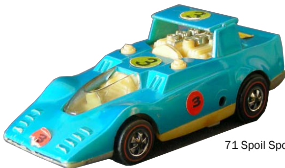
71 Spoil Sport