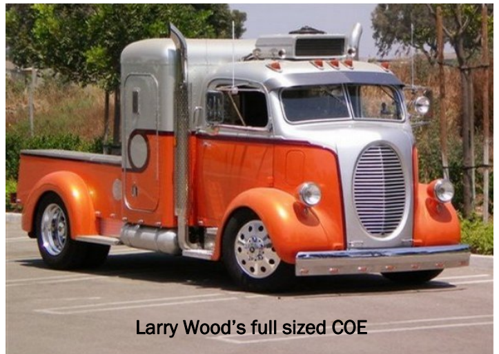
Larry Wood's full sized COE

This was a highly detailed 1/24th scale animated diorama