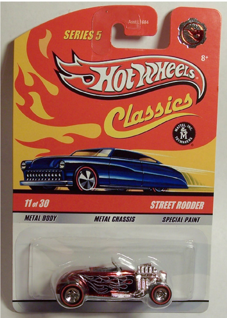
CHASE CLASSIC STREET RODDER