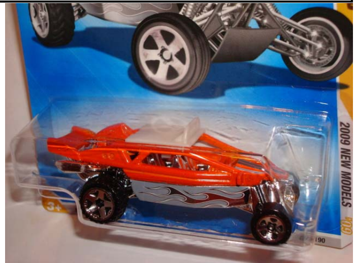
DUNE IT UP