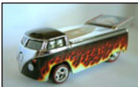
Volkswagen Drag Truck