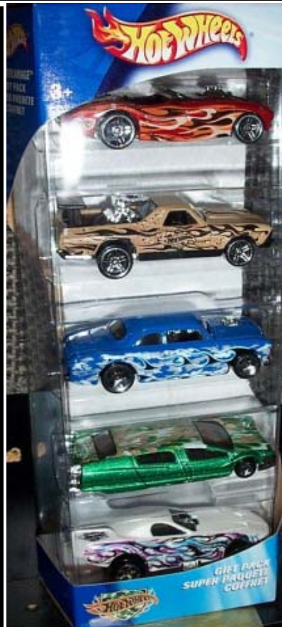
Camouflage 5 pack

For anyone who has not read the fine print on the wing of the Mad Props here it is: