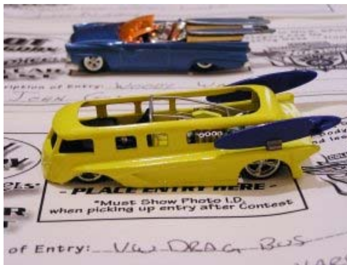
(Continued on page 4)

I know you can't make it out but Cookie's t-shirt has a picture of Bart Dalton on it with the caption "MIA have you seen this collector". The other shirts say something to the effect of "If You Ain't Banned, You Ain't Something" but I think it is a four letter word.